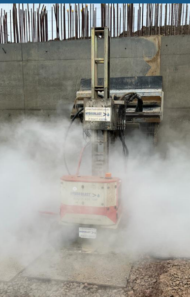
Circular power heads